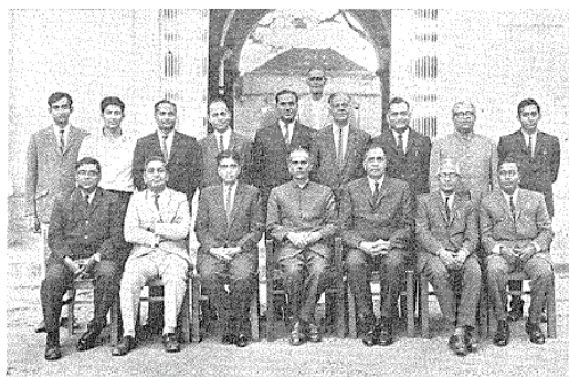
The Alumni Executive Committee