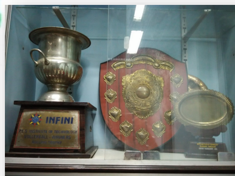
PESIT INFINI-06 Volleyball - Winners; Rolling Trophy; NITTE Cricket Tournament 04

We tried to get details about other Cups and Shields in college which various sports individuals/teams have won for the college, but were not successful. We will keep trying to get more information and update you once we have more details