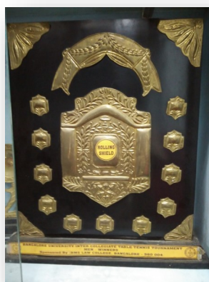
Bangalore University Inter Collegiate Table Tennis - Mens Winners