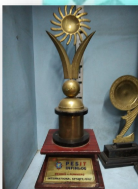
PESIT INFINI-06 Tennis - Runners (International Sports Fest)