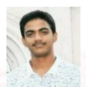
Rovin 5th Sem MECH