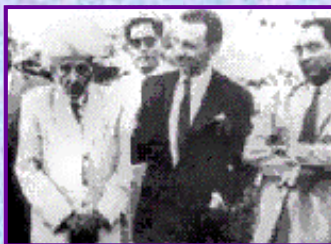
Sir MV with JRD Tata and Homi J Bhabha